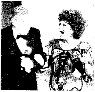
Johnnie Ray, Kay Starr