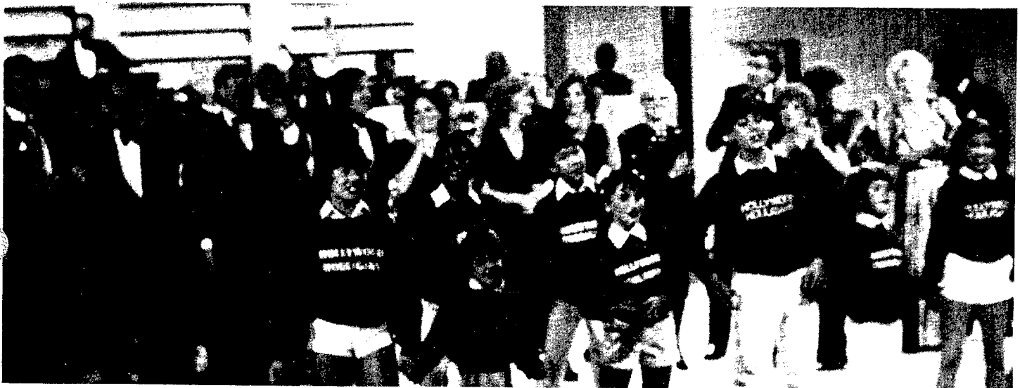
"Sentimental Sounds Appeal" Finale