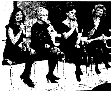
The Lennon Sisters