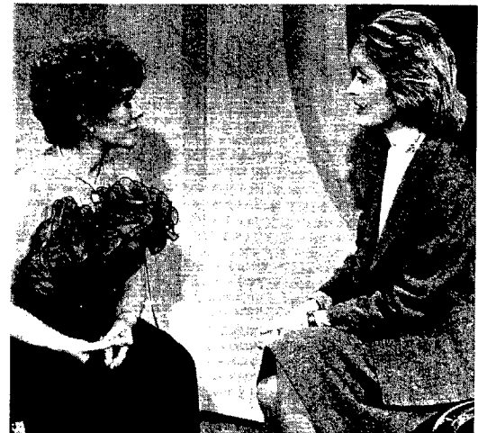
Shari Lewis & Florence Henderson