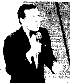
Frank Sinatra, Jr