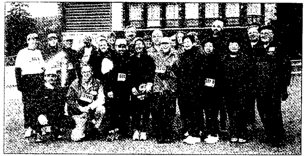
Western Canadian runners and walkers before start in Jasper, AB.

The Better Hearing Institute will once again use the contributions from the two Canadian events for hearing awareness projects. The funds raised in this year's Canadian East vs. West Fun Run/Walks will support a reprinting of BHI's Answers to Common Question about Assistive Technology . Last year the funds raised through the races were used to reprint Nerve Deafness and You , a booklet that discusses the facts and myths about hearing loss. Donations from previous years supported diverse awareness projects,