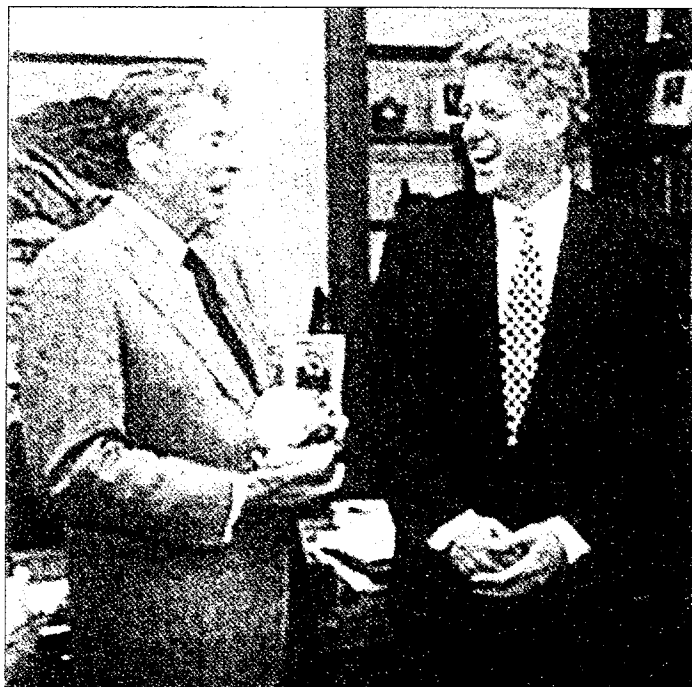
Presidents Reagan and Clinton helped the Institute increase requests for information, with the announcement of their hearing help. Both wear binaural hearing aids.