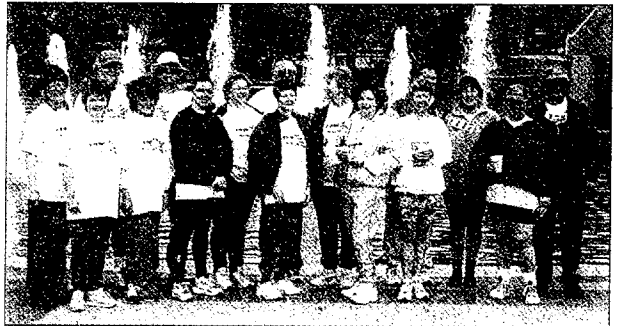
A.H.I.P. attendees race at the University of Toronto.

including announcements in Canada's Cineplex Odeon theater lobbies and the release of three television public service messages to Canadian TV stations that featured actors Richard Thomas, Robin Wright, and puppeteer Shari Lewis. ■