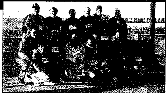
Fun Run participants run on the Boardwalk.

BHI held its annual Fun Run/Walk on the Boardwalk in Atlantic City during the 1998 meeting of the New Jersey Association of Hearing Health Professionals and the New York State Hearing Aid Society. Runners and walkers enjoyed a brisk race down the Boardwalk, collecting funds to help BHI expand awareness of hearing solutions.